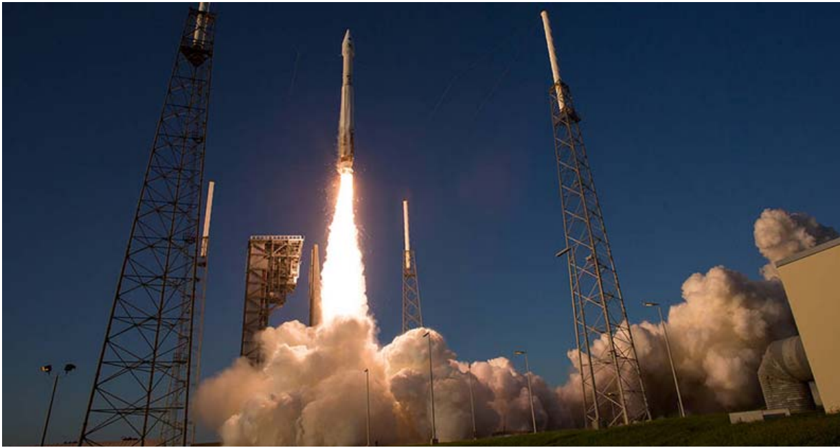
The space rocket carrying NASA's OSIRIS-REx spacecraft lifts off.